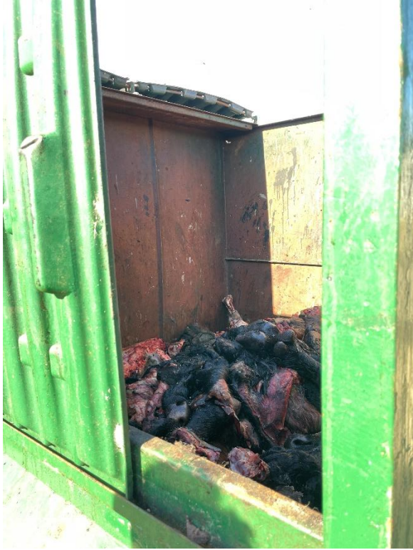
Photo 6 – Animal remains inside dumpster with side door opened for photo Taken by Jennifer Ramos-Buschmann on 10/25/23, 2:27 PM