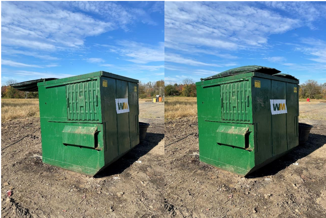
Photos 7 and 8 – Dumpster with lid initially open which was then closed and did not make a tight seal Taken by Jennifer Ramos-Buschmann on 10/25/23, 2:28 PM