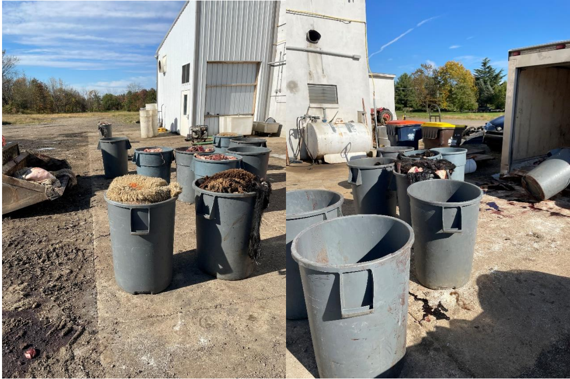
Photos 1 and 2 – Smaller trash bins and bucket of front-end loader filled with animal skins and salted hide trailer behind slaughterhouse Taken by Jennifer Ramos-Buschmann on 10/25/23, 2:21 PM