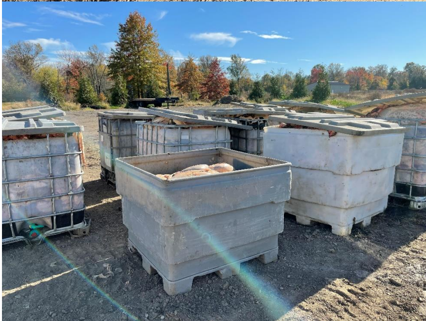
Photos 3, 4, and 5 – Rendering bin storage area with one rendering bin that was uncovered and other bins with lids that did not make a tight seal

on 10/25/23, 2:24 PM, 2:25 PM, and 2:26 PM