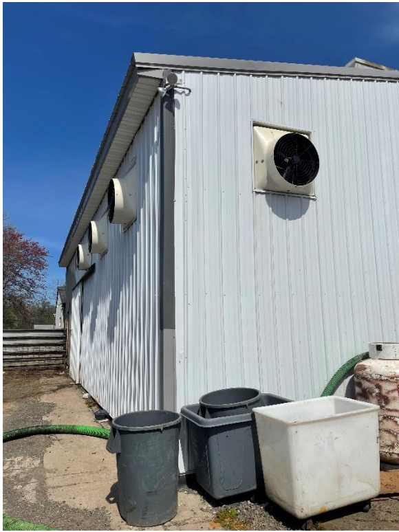
Photo 3 – Vents from singeing room on 4/16/24, 3:00 PM