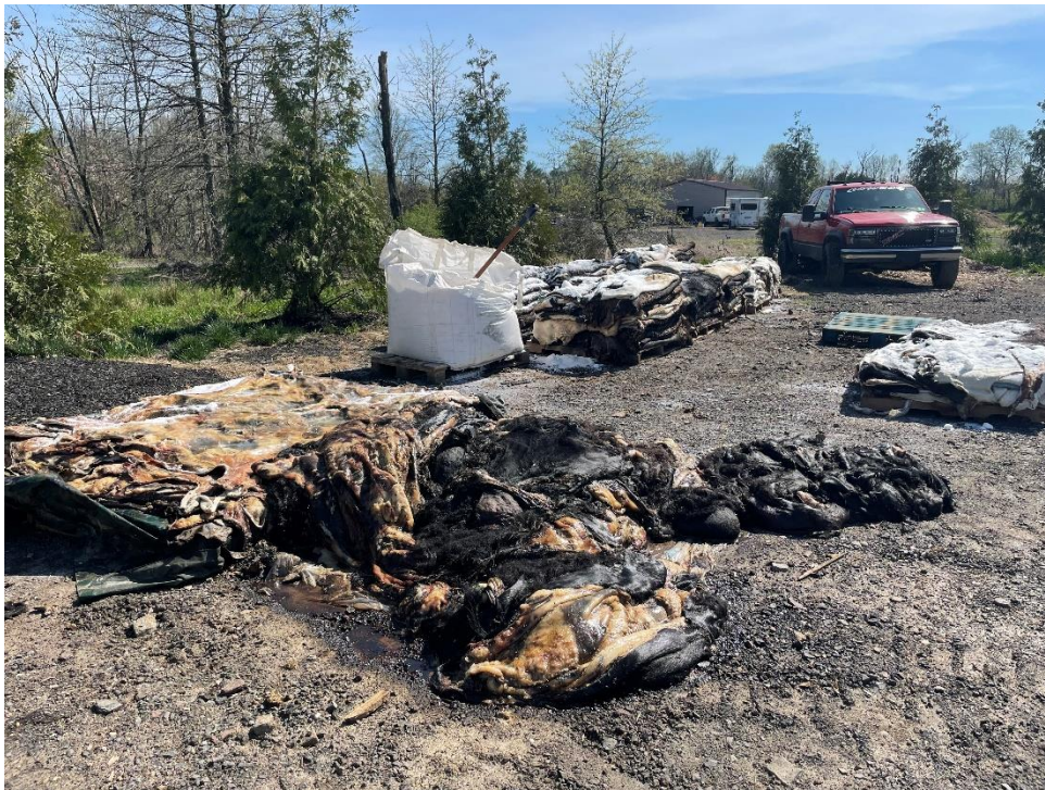
Photo 9 – Salted and unsalted cowhides drying in the sun