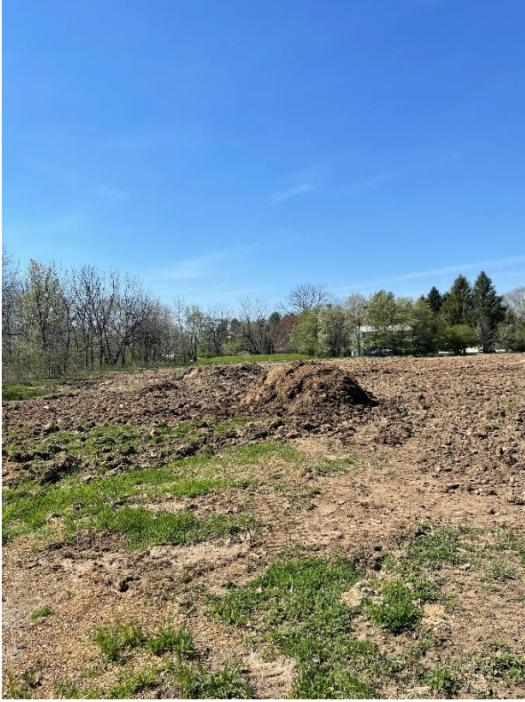
Photo 10 – Two piles of manure in the field to the right of the facility (when facing front of facility) Taken by Jennifer Ramos-Buschmann on 4/16/24, 3:14 PM