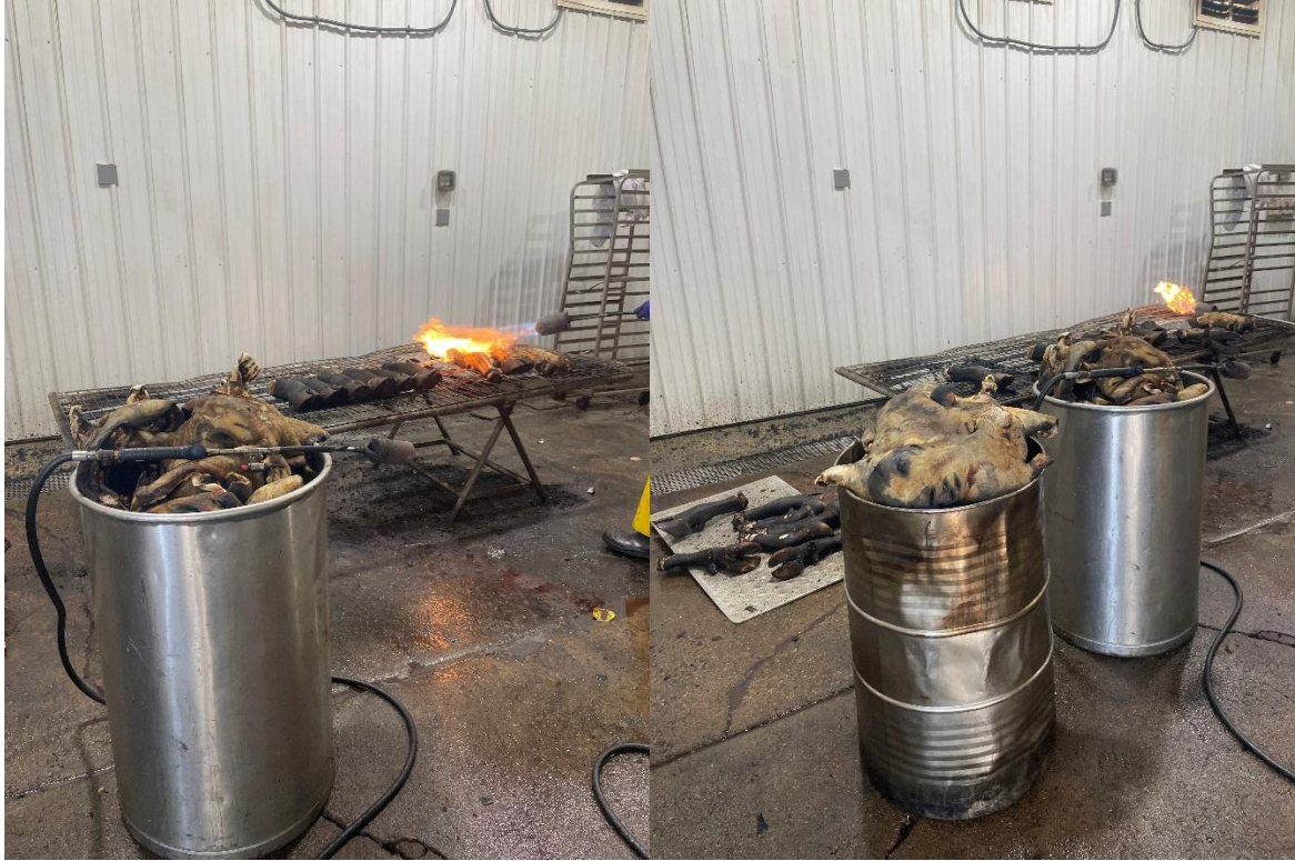
Photos 1 and 2 – Singeing room with singeing actively taking place in Photo 1 on 4/16/24, 3:52 PM and 3:50 PM