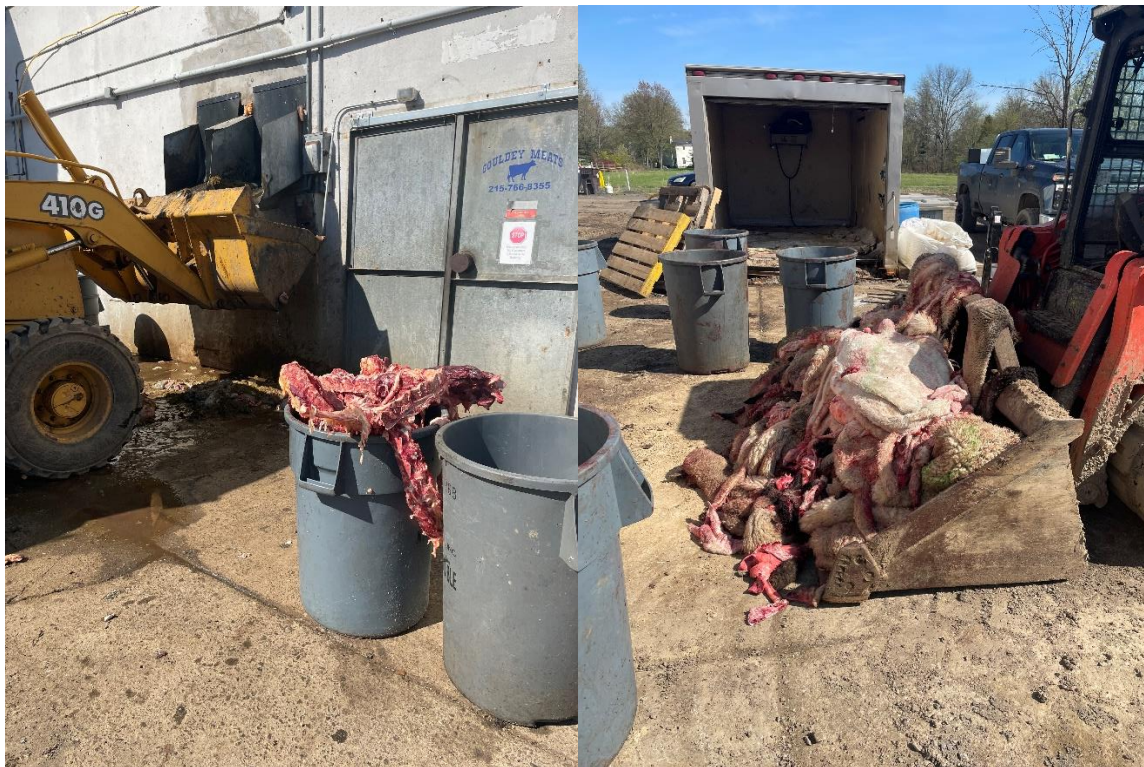
Photos 6 and 7 – Trash bin filled with animal body parts and bucket of backhoe filled with animal skins Taken by Jennifer Ramos-Buschmann on 4/16/24, 3:51 PM