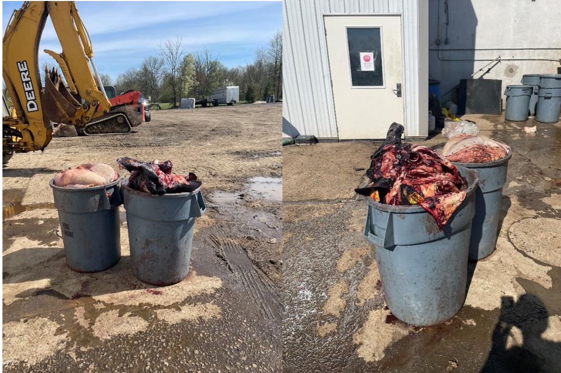
Photos 4 and 5 – Two of three trash bins filled with animal body parts Taken by Jennifer Ramos-Buschmann on 4/16/24, 3:00 PM and 3:51 PM