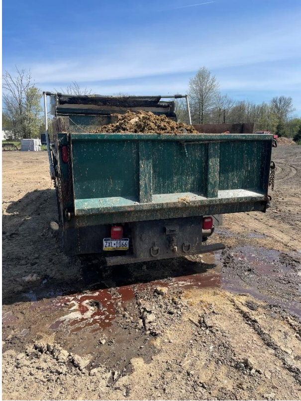
Photo 8 – Truck filled with rendering material which leaked blood and other bodily fluids Taken by Jennifer Ramos-Buschmann on 4/16/24, 3:03 PM