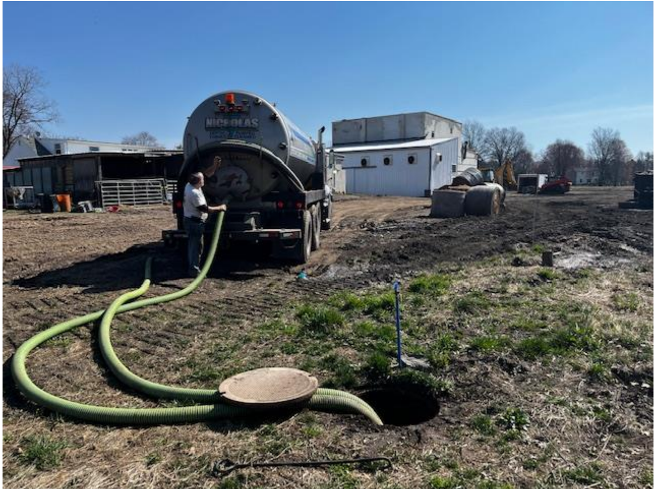
Image 3: Image taken at Kingdom Provision displaying the pumping and removal of liquid waste.