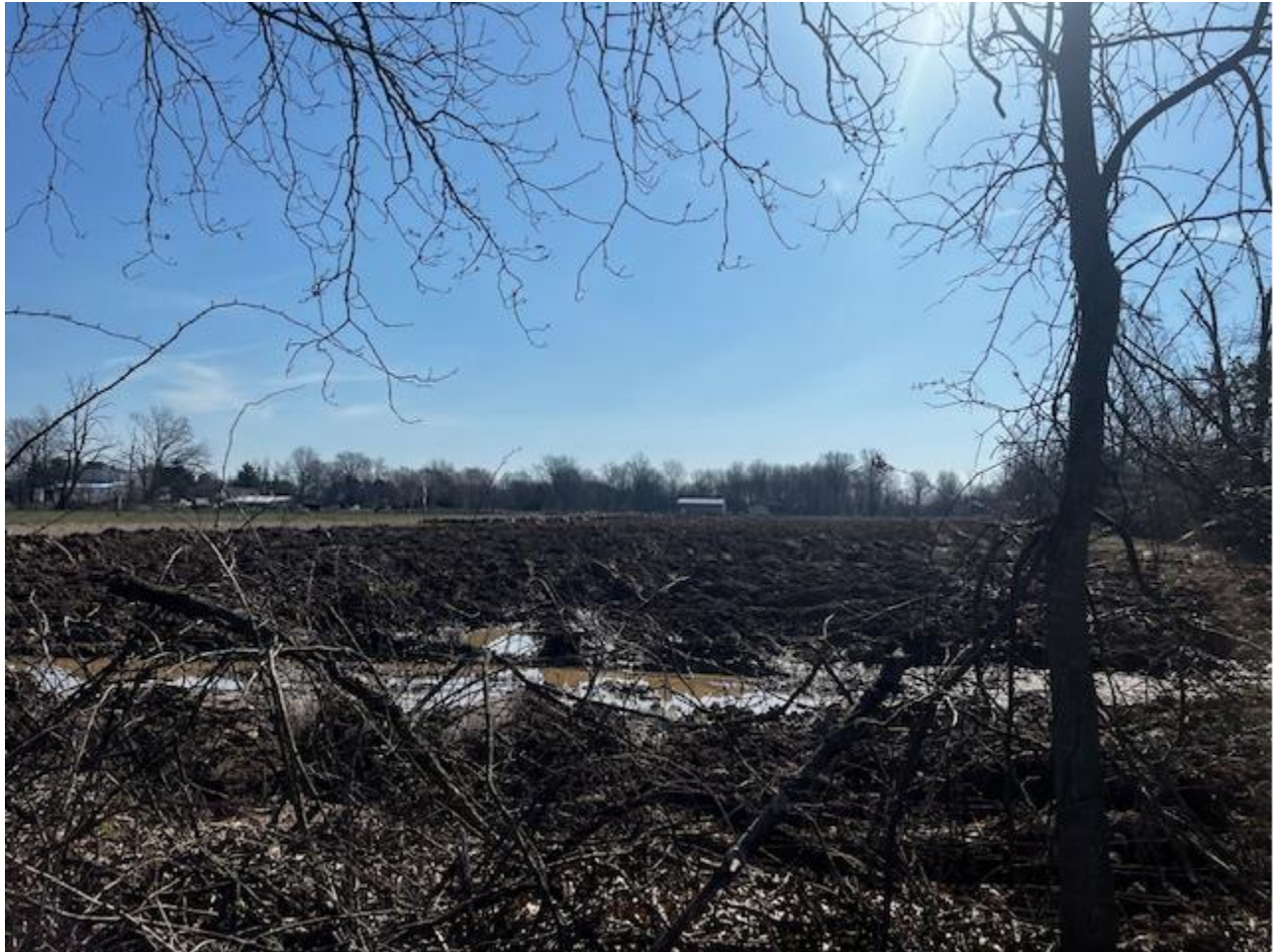
Image 2: Image taken at 6030 Durham Rd. at the fence line where a berm is present and storm water is pooling.