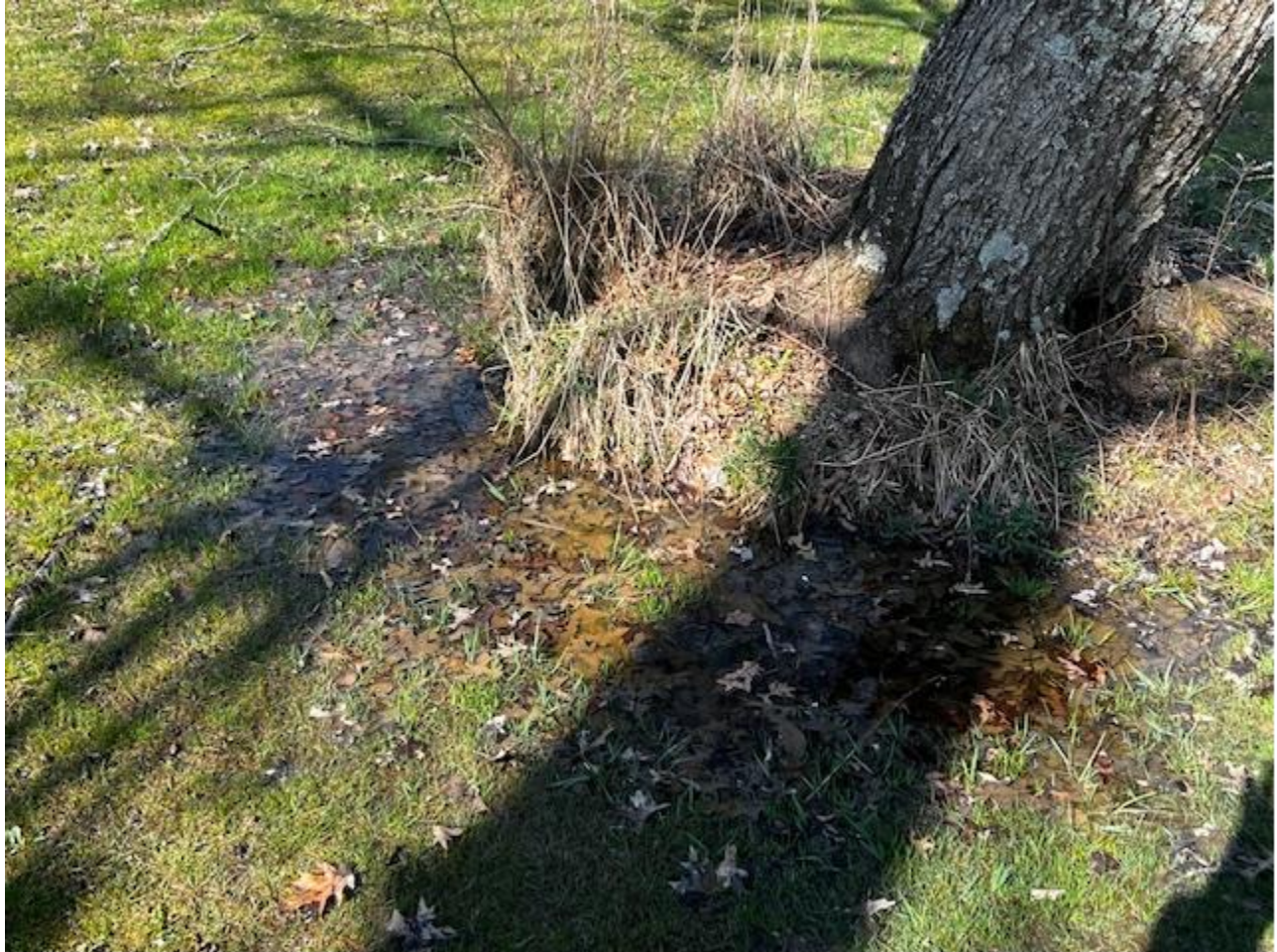
Image 1: Image taken at 6030 Durham Rd. displaying pooling storm water. Taken by Jonathan Bower on 3/14/2024