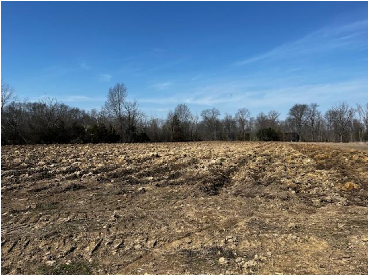
Image 4: Image taken at Kingdom Provisions of the field where land application has occurred. Taken by Jonathan Bower on 3/14/2024