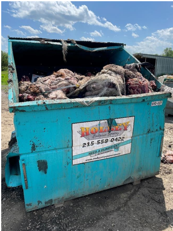
Photo 2 – Dumpster filled with heads and other animal remains Taken by Jennifer Ramos-Buschmann on 5/8/24, 2:42 PM