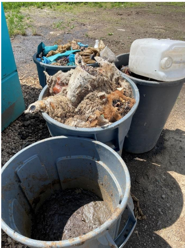
Photo 4 – Trash bins filled with animal remains and trash with numerous flies and maggots on 5/8/24, 2:42 PM