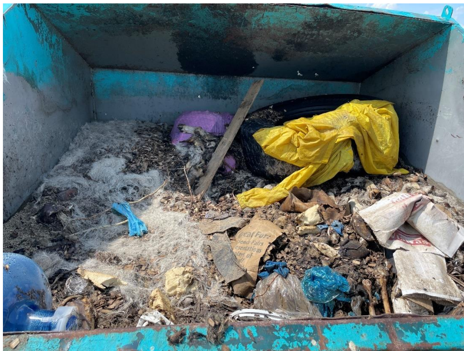
Photo 7 – Second dumpster filled with animal remains, wood chips, and trash Taken by Jennifer Ramos-Buschmann on 5/8/24, 2:43 PM