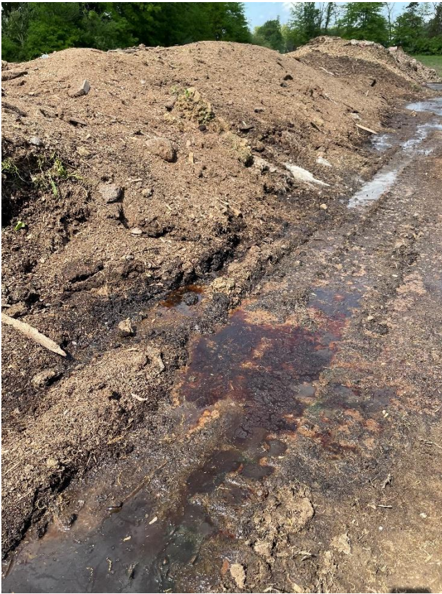
Photo 14 – Pools of blood and water on side of compost pile Taken by Jennifer Ramos-Buschmann on 5/8/24, 2:50 PM