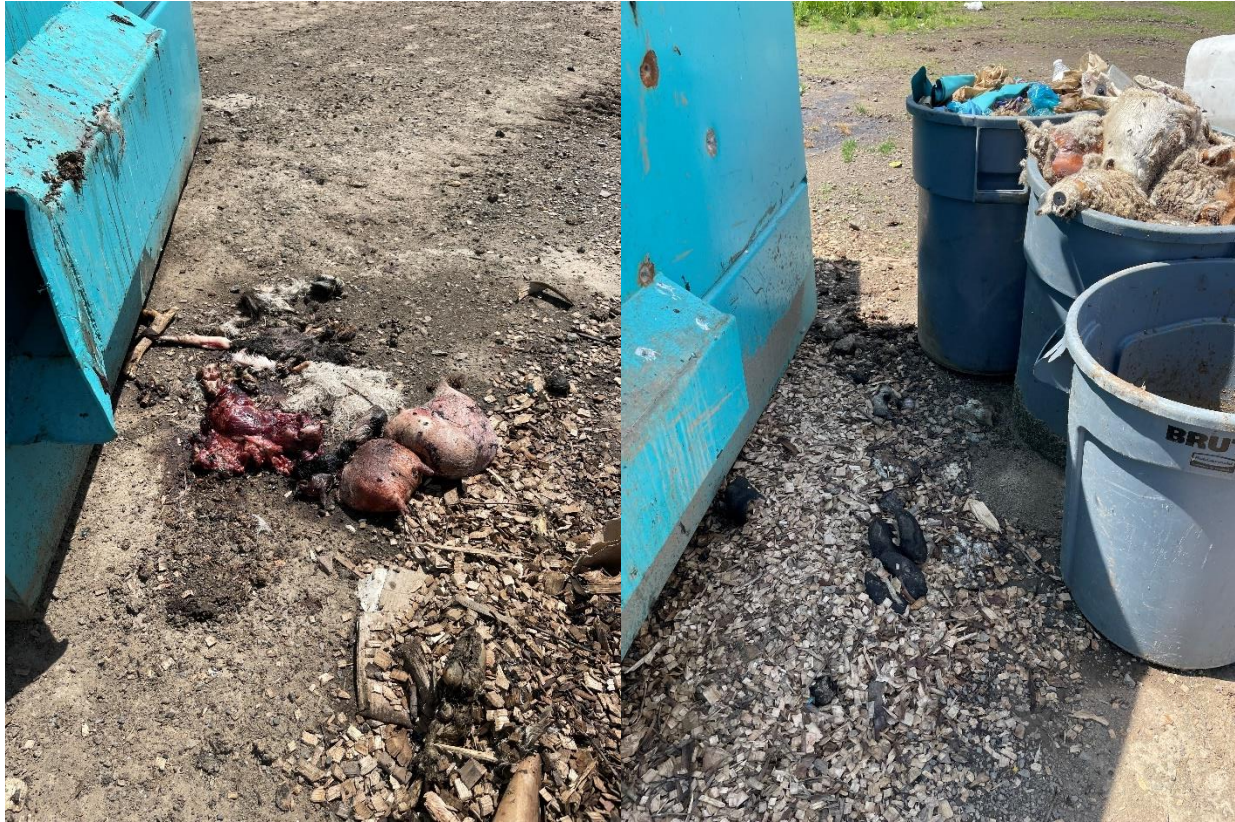
Photos 5 and 6 – Animal remains on ground near dumpsters and trash bins on 5/8/24, 2:42 PM and 2:43 PM