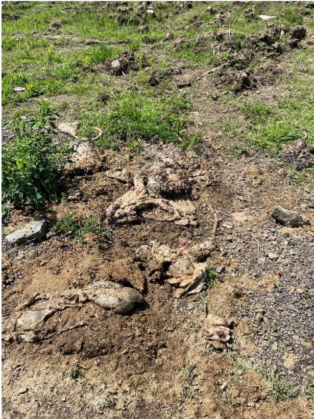
Photos 8, 9, and 10 – Animal remains on ground along pathway to compost pile Taken by Jennifer Ramos-Buschmann on 5/8/24, 2:43 PM, 2:45 PM, and 2:45 PM