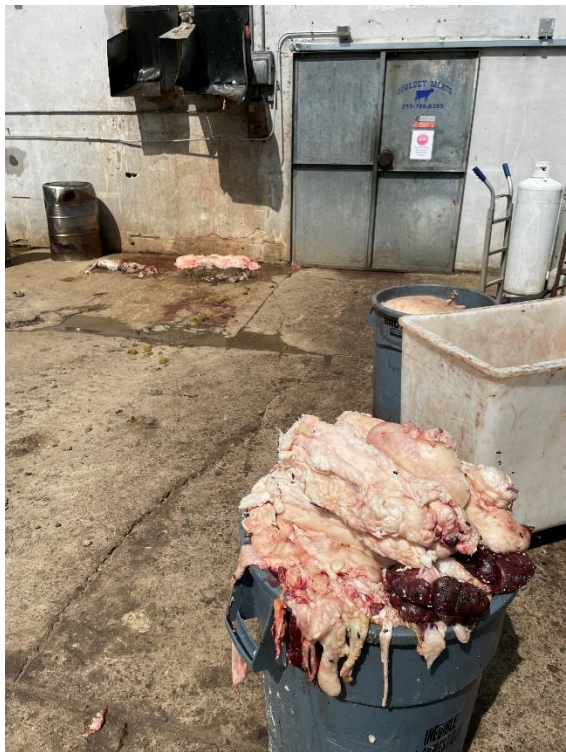
Photo 16 – Trash bin filled with animal remains and animal remains on ground near chutes Taken by Jennifer Ramos-Buschmann on 5/8/24, 2:56 PM