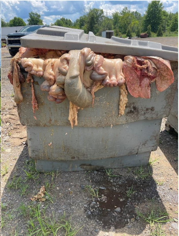
Photos 1 and 2 – Containers of entrails of slaughtered animals Taken by Jennifer Ramos-Buschmann on 7/31/23, 12:50 PM