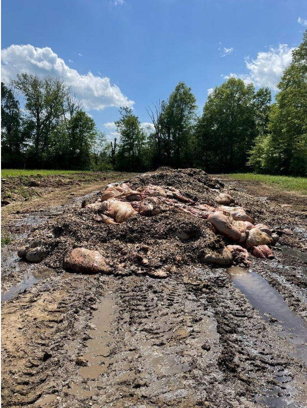
Photo 11 – Uncovered cow stomachs on compost pile on 5/8/24, 2:48 PM