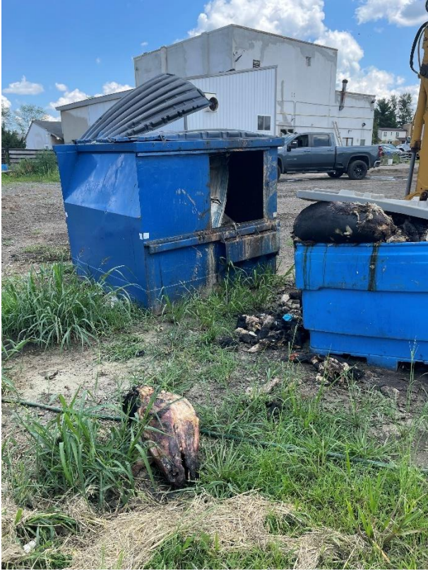
Photo 5 – Head and feet of slaughtered animals on ground adjacent to containers and dumpster Taken by Jennifer Ramos-Buschmann on 7/31/23, 12:58 PM