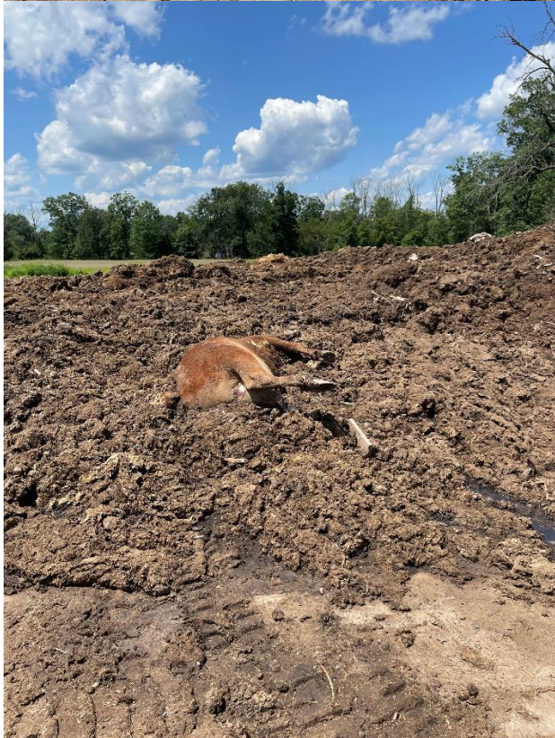
Photos 9 and 10 – Exposed cow carcass and discolored standing water in compost pile Taken by Jennifer Ramos-Buschmann on 7/31/23, 1:05 PM and 1:06 PM