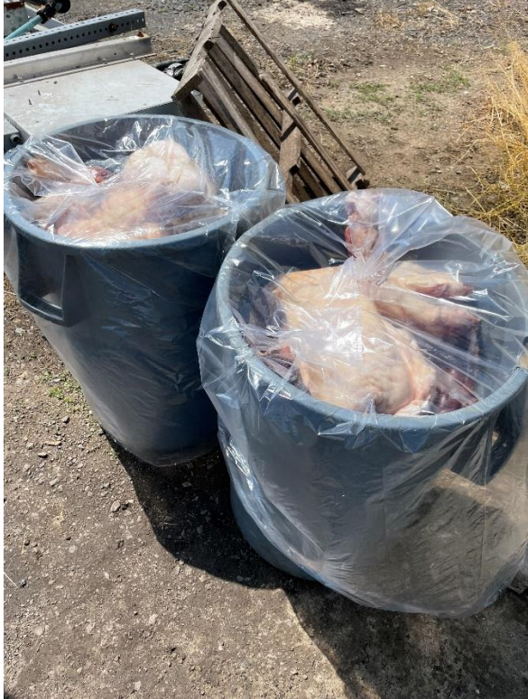
Photo 1 – Trash bins filled with fat covered in plastic Taken by Jennifer Ramos-Buschmann on 5/8/24, 2:41 PM