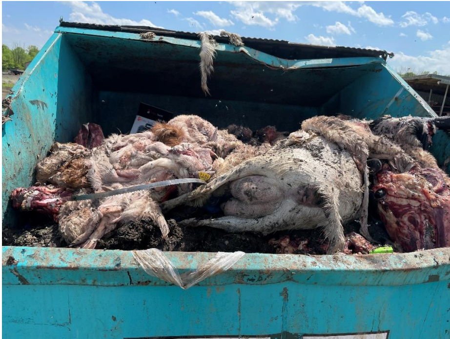
Photo 3 – Close-up of dumpster filled with heads and other animal remains on 5/8/24, 2:42 PM