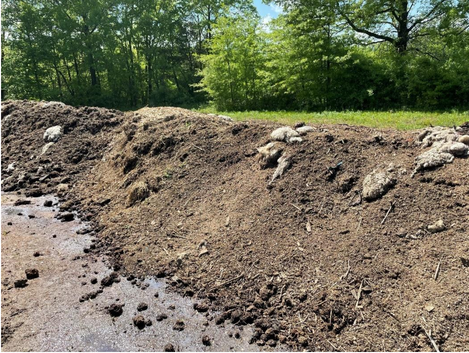
Photo 13 – Mostly covered portion of compost pile Taken by Jennifer Ramos-Buschmann on 5/8/24, 2:49 PM