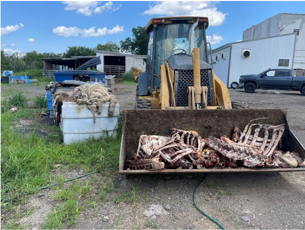
Photo 6 – Cow backbones stored in bucket of backhoe Taken by Jennifer Ramos-Buschmann on 7/31/23, 12:59 PM