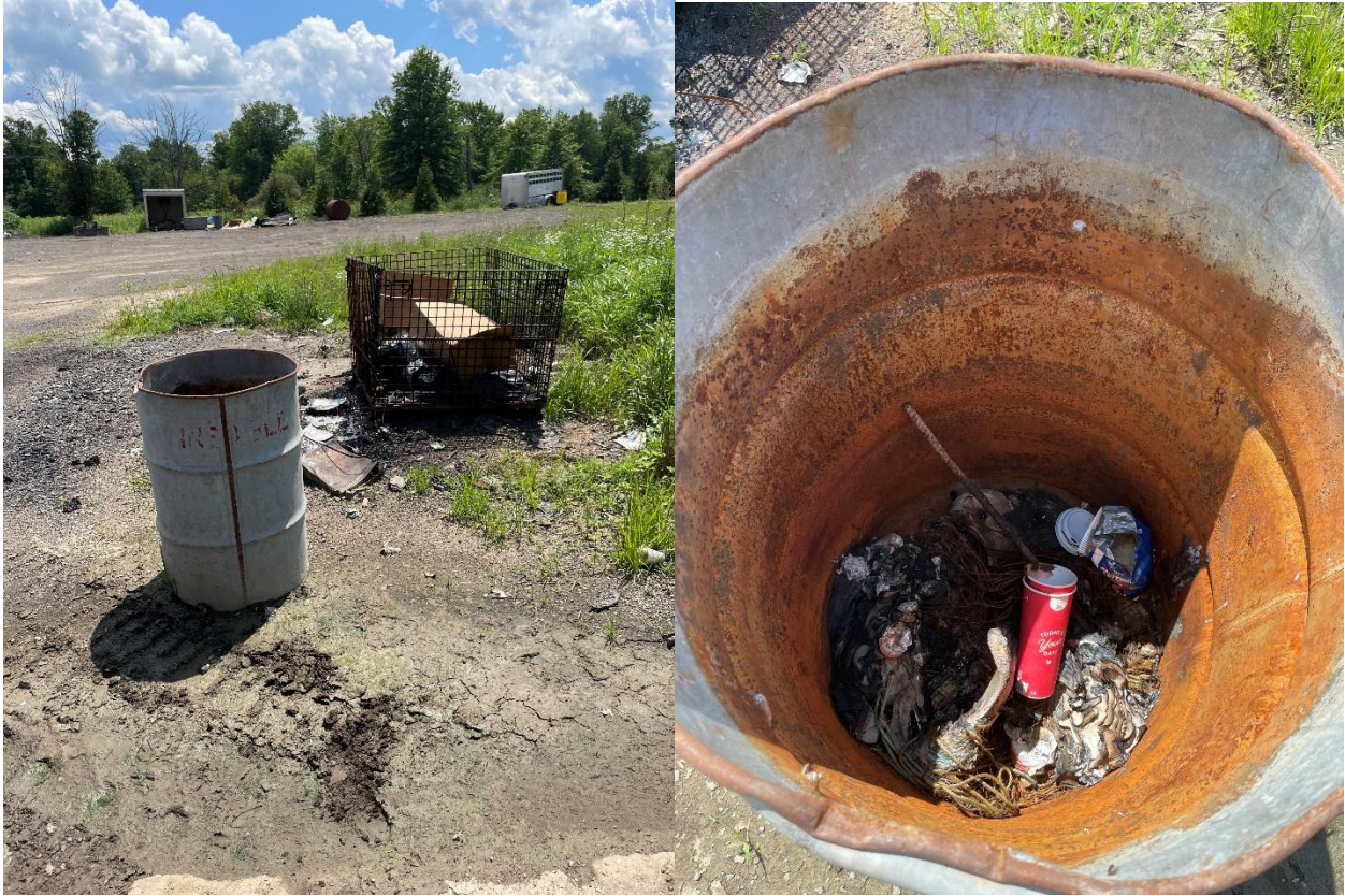
Photos 7 and 8 – Burn barrel containing a conglomerate of solid waste and animal remains