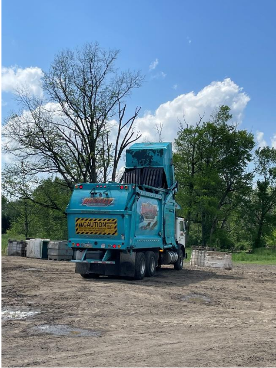
Photo 17 – Holley dump/trash truck picking up the contents of the two dumpsters Taken by Jennifer Ramos-Buschmann on 5/8/24, 2:58 PM