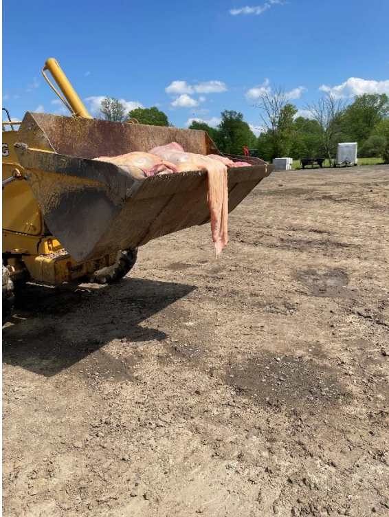
Photo 15 – Front end loader carrying animal remains to compost pile on 5/8/24, 2:56 PM