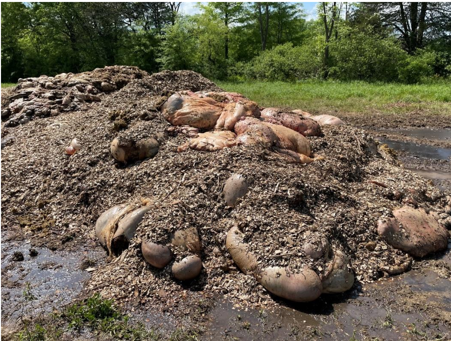
Photo 12 – Close-up of uncovered cow stomachs on compost pile Taken by Jennifer Ramos-Buschmann on 5/8/24, 2:48 PM